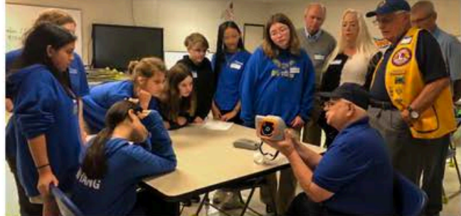
Recycling old eyeglasses and learning about vision screenings