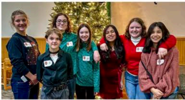
VIP Christmas Party