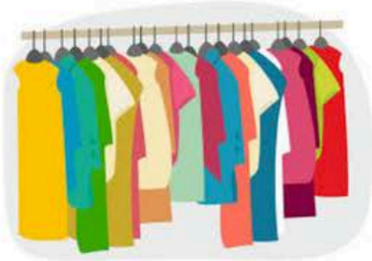
Clothing closet clean up